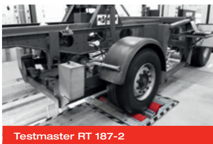
Testmaster RT 187-2