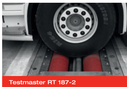
Testmaster RT 187-2

Архангельск (8182)63-90-72 Астана (7172)727-132 Астрахань (8512)99-46-04 Барнаул (3852)73-04-60 Белгород (4722)40-23-64 Брянск (4832)59-03-52 Владивосток (423)249-28-31 Волгоград (844)278-03-48 Вологда (8172)26-41-59 Воронеж (473)204-51-73 Екатеринбург (343)384-55-89 Иваново (4932)77-34-06