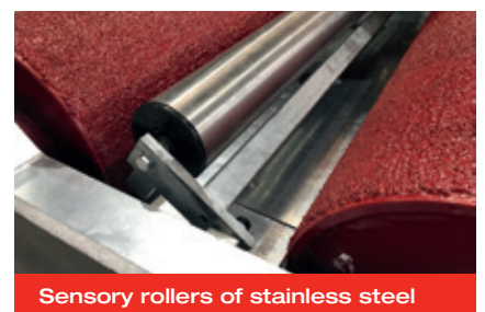
Sensory rollers of stainless steel

Архангельск (8182)63-90-72 Астана (7172)727-132 Астрахань (8512)99-46-04 Барнаул (3852)73-04-60 Белгород (4722)40-23-64 Брянск (4832)59-03-52 Владивосток (423)249-28-31 Волгоград (844)278-03-48 Вологда (8172)26-41-59 Воронеж (473)204-51-73 Екатеринбург (343)384-55-89 Иваново (4932)77-34-06