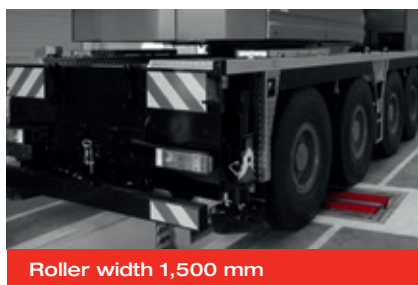
Roller width 1,500 mm