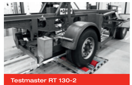
Testmaster RT 130-2