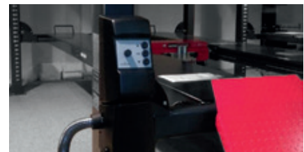
Control unit and power pack on rear left post