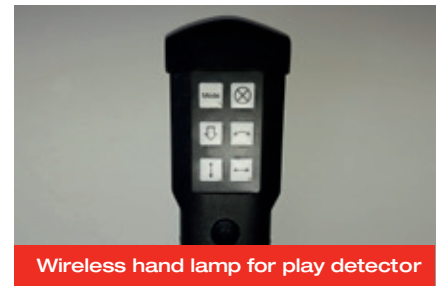
Wireless hand lamp for play detector