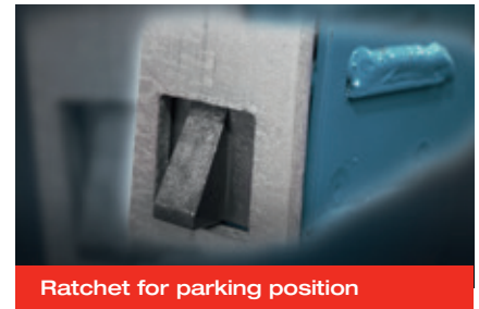
Ratchet for parking position

Архангельск (8182)63-90-72 Астана (7172)727-132 Астрахань (8512)99-46-04 Барнаул (3852)73-04-60 Белгород (4722)40-23-64 Брянск (4832)59-03-52 Владивосток (423)249-28-31 Волгоград (844)278-03-48 Вологда (8172)26-41-59 Воронеж (473)204-51-73 Екатеринбург (343)384-55-89 Иваново (4932)77-34-06