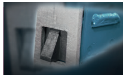
Ratchet for parking position