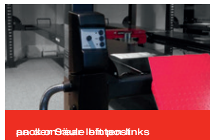
Control panel and steering mechanism