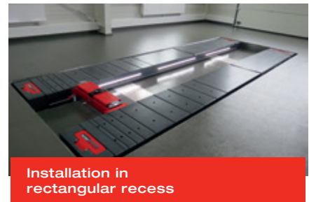
Installation in rectangular recess