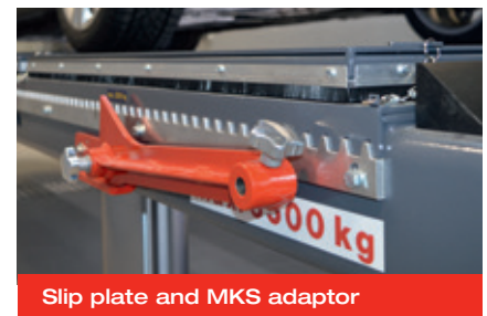
Slip plate and MKS adaptor

Архангельск (8182)63-90-72 Астана (7172)727-132 Астрахань (8512)99-46-04 Барнаул (3852)73-04-60 Белгород (4722)40-23-64 Брянск (4832)59-03-52 Владивосток (423)249-28-31 Волгоград (844)278-03-48 Вологда (8172)26-41-59 Воронеж (473)204-51-73 Екатеринбург (343)384-55-89 Иваново (4932)77-34-06